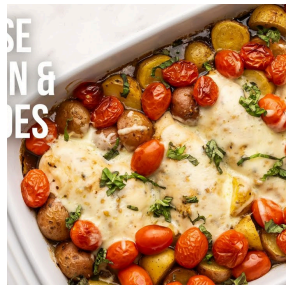
Caprese Chicken and Potatoes {VIDEO}