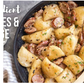
Perogies and Sausage Skillet