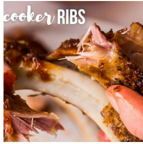
Easy Slow Cooker BBQ Ribs + VIDEO