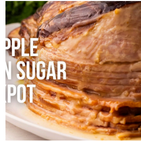
Pineapple Brown Sugar Glazed Crockpot Ham