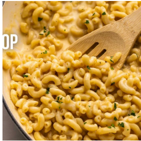
Easy Homemade Mac and Cheese