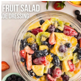
Creamy Fruit Salad Recipe [VIDEO]